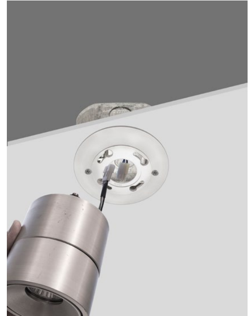
Step 3- Connect wiring before mounting fixture to mounting plate