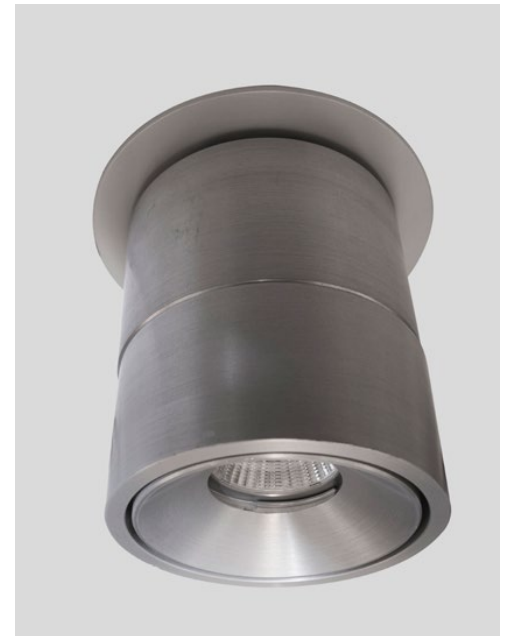
Step 6- Finish installation