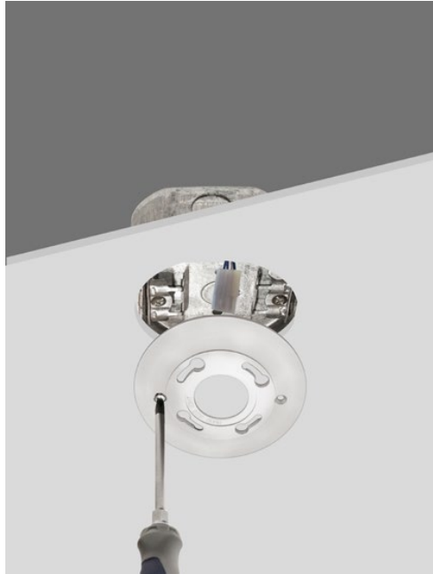
Step 2- Attach junction mounting plate to ceiling box with #8-32 counter sink screws (Screws supplied by SLI)