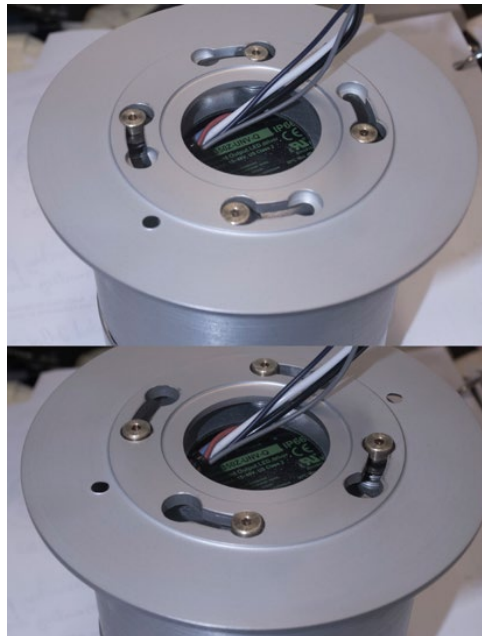
Step 5- Top view closeup of gold pins and keyway slots. Make sure housing pins have locked into keyway slots.