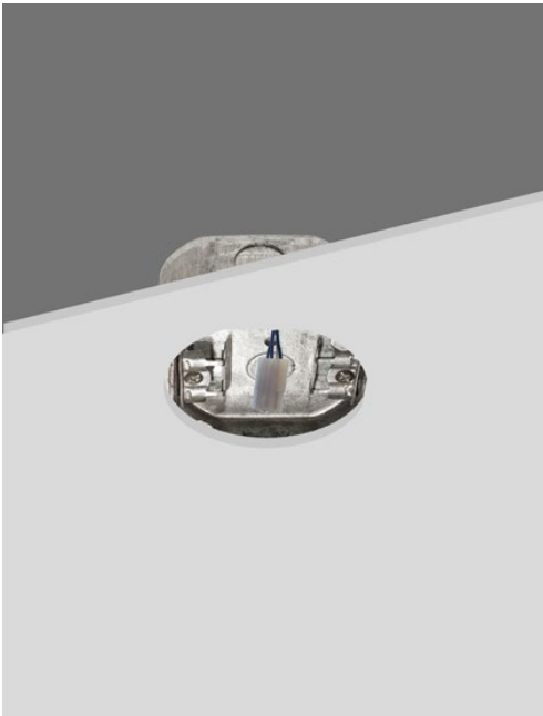
Step 1- Ceiling box above ceiling. Cut-out opening in drywall.