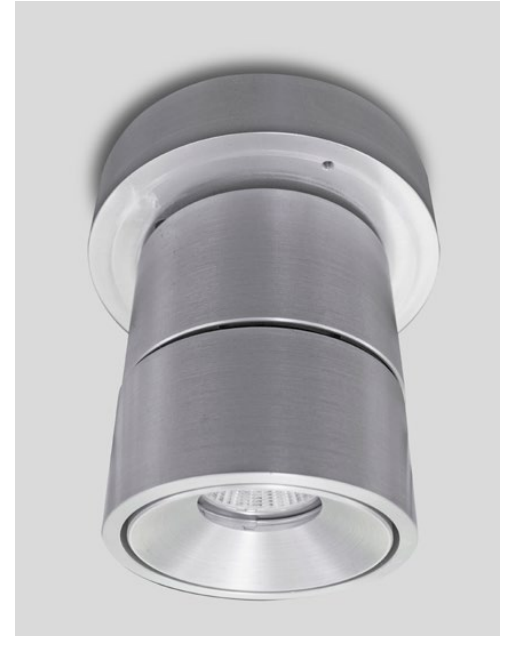
Step 6- Finish installation