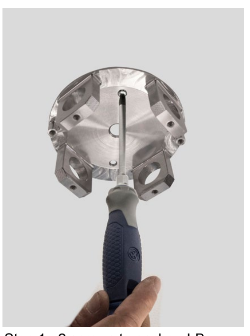
Step 1- 2 screws to anchor J-Box Ceiling Plate to ceiling