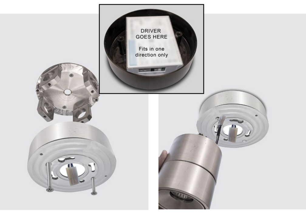
Step 2- Attach Lutron Junction Mounting Driver Box to ceiling plate with #8-32 counter sink screws (Screws supplied by SLI). Driver must be installed before installing Lutron driver box to ceiling.