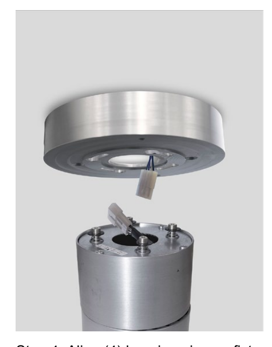
Step 4- Align (4) housing pins on fixture to Lutron Driver Box (4) keyway slots. Push housing into Driver Box while twisting clockwise. (See step 5 for linking mechanism)