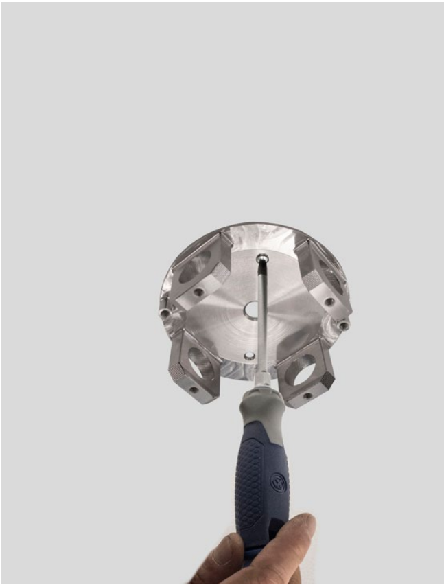
Step 1- 2 screws to anchor J-Box Ceiling Plate to ceiling