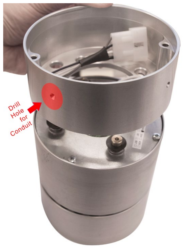
Step 2- Cut-out 3/4" hole centered around punchout holes in surface junction box (up to 4 holes)