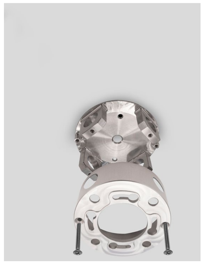
Step 3- Attach surface mounted j-box to ceiling plate with #8-32 counter sink screws (supplied by SLI)