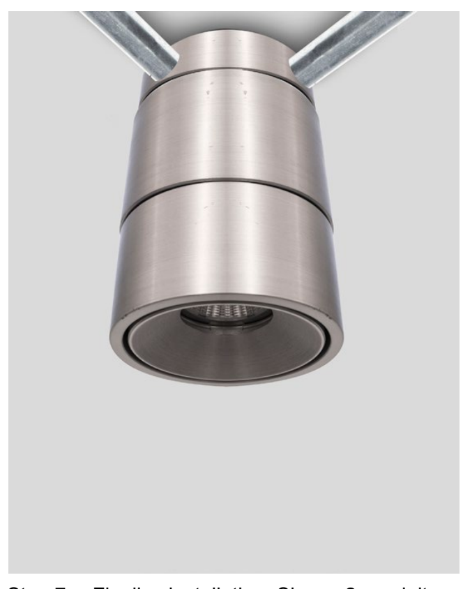
Step 7- Finalize installation. Shown 2 conduit at 90 degree angle. See Step 8 for more options.

Step 5- Connect wiring from fixture to wiring in conduit and push housing into junction box.