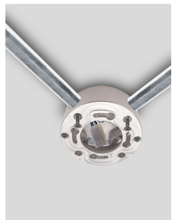
Step 4- Thread conduit thru holes in junction box and use screws to anchor conduit in place.