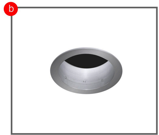
Step B- Flanged trim is installed with wing springs holding trim into ceiling * Ensure enough support is used to keep fixture in ceiling