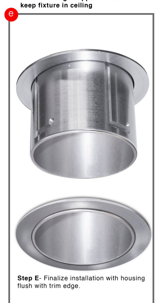
Step E- Finalize installation with housing flush with trim edge.