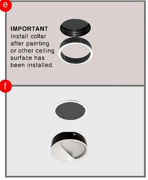
Step E- Flanged collar should be installed after painting, wood, metal ceiling has been prepped. Screw flanged collar into housing. Step F- Slide lamp assembly into collar.