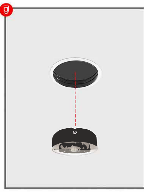
Step G- Position trim to face wall (See below for proper trim position.).